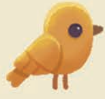
Three orange birds