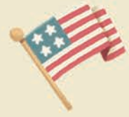
Two American flags