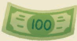
And one $100 bill

See the answers by visiting uscurrency.gov/lessonplans or scanning the QR code.